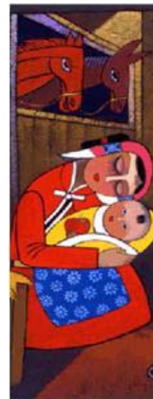
"Magi" by He Qi